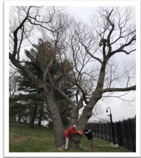
County Champion Black Willow

Visiting a champion tree is an incredible opportunity to reflect on the lifetime of the tree. A champion tree may have attained its stature through very advanced age or perhaps the tree was lucky enough to grow in very favorable conditions. How many significant events have occurred near the tree throughout its lifetime? For example, the Champion Golden Larch was likely planted just after Building 41 was constructed and has seen many of the changes made to the southern side of the campus. The Champion Black Willow is thought to be a remnant of the Town & Country Golf course that used to reside on the Bethesda campus. Who might this tree have witnessed golfing? We could also consider the conditions that have allowed these trees to grow taller or wider than any others near it? How did this tree come to grow in this spot? Was it an accident or thoroughly planned? Many of these questions may never have answers, but it certainly leads to a greater appreciation of nature!