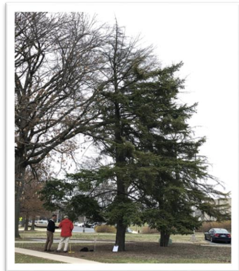
County Champion Carolina Hemlock