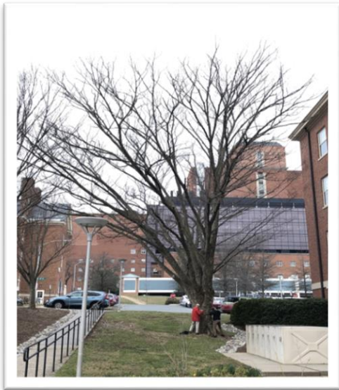
Former Champion Japanese Zelkova