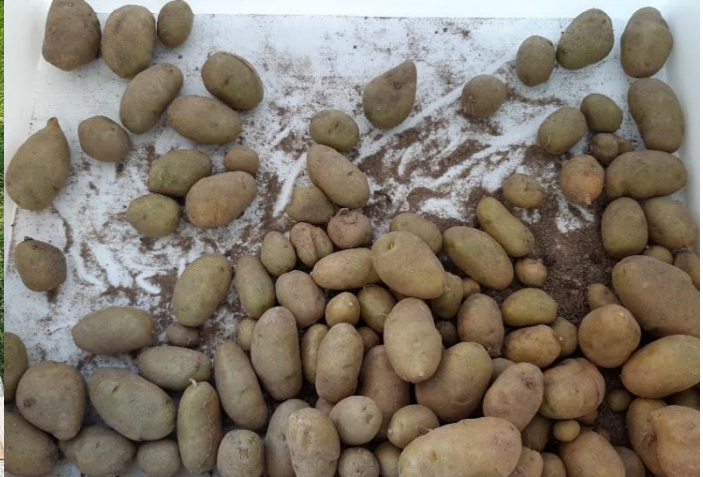
Left: Potato plants in a “Pick & Pay” plot. Right: Potatoes harvested from these plants.