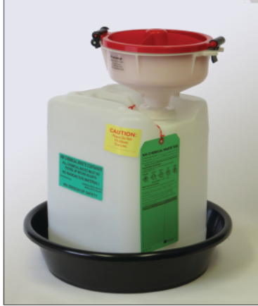
3 and 5 Gallon plastic carboys

Authorized chemical waste containers, spill pans and EPA-approved funnels are all supplied upon request by the NIH Chemical Waste Services at Pittj@mail.nih.gov