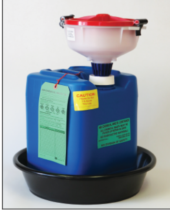
3 and 5 Gallon plastic carboys