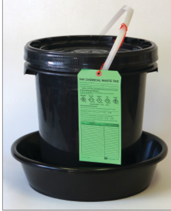
5 Gallon plastic pail for solids